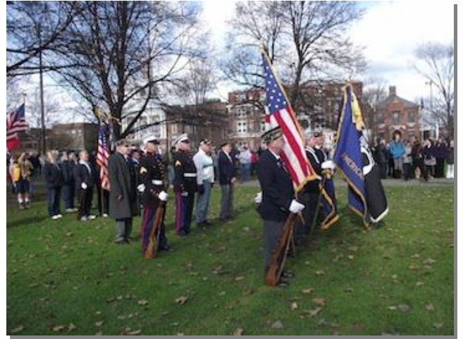
Veterans from all Services and wars, families and friends gather for the Lebanon Veteran's Day program in Colburn Park.